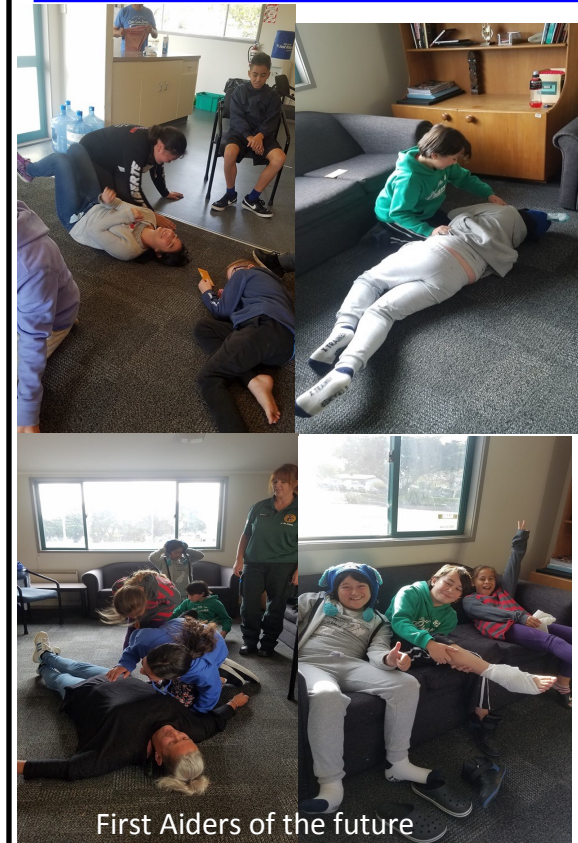
First Aiders of the future